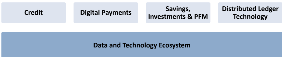
Figure 1: Fintech Market Segments and Ecosystem

lending, securities clearing and settlement, and personal financial planning and investing. Banks, investment advisors, and other traditional financial service providers have also begun adopting new technologies by partnering with fintech firms and/or by developing these new technologies in house.